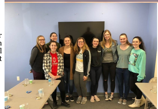
North Country Children’s Museum

Thank you for supporting Clarkson SWE throughout the years. We truly appreciate it. If you would like to give us feedback or share your experiences at Clarkson do not hesitate to contact us! Subscribe to our monthly newsletters by emailing swe@clarkson.edu , with subject line “Newsletter Subscription.”