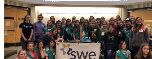
Girl Scout Event