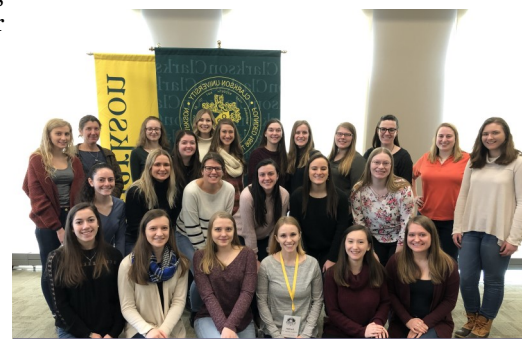
COGO Alumni Event